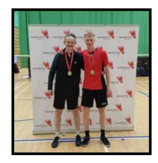
All England Over 50 winners 2023

I hope you all have a great summer and comeback next season ready to go again.