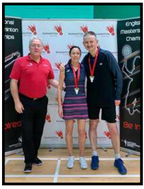
National O50Mixed Winners