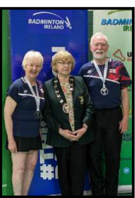
Irish Invitation Silver