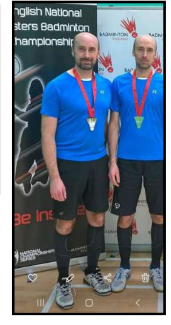
White Brothers Winners