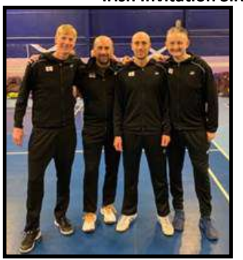
McCoig Trophy England Squad